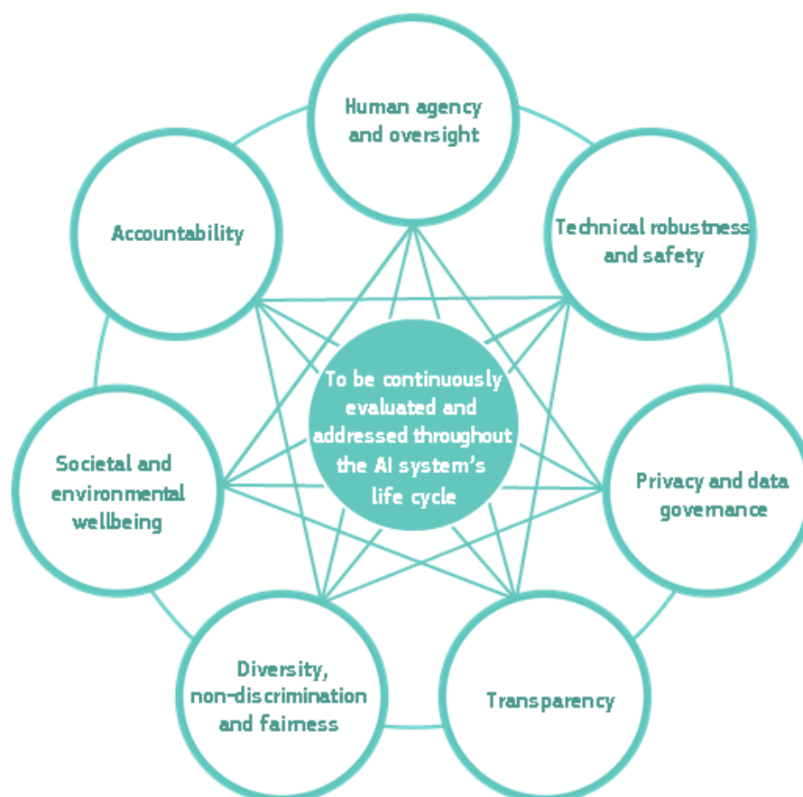
Figure 2: Interrelationship of the seven requirements: all are of equal importance, support each other, and should be implemented and evaluated throughout the AI system's lifecycle

While all requirements are of equal importance, context and potential tensions between them will need to be taken into account when applying them across different domains and industries. Implementation of these requirements should occur throughout an AI system's entire life cycle and depends on the specific application. While most requirements apply to all AI systems, special attention is given to those directly or indirectly affecting individuals. Therefore, for some applications (for instance in industrial settings), they may be of lesser relevance.